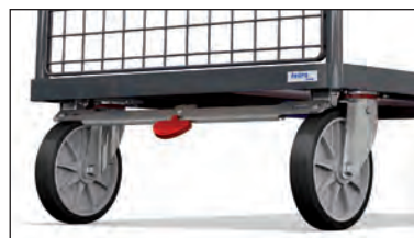
TOTALSTOP - the fetra central brake system With only one foot the rotation of wheels and the swivelling movement of both swivel castors can be securely locked. The brake pedal is always visible to the operator. Standard with TOTALSTOP.