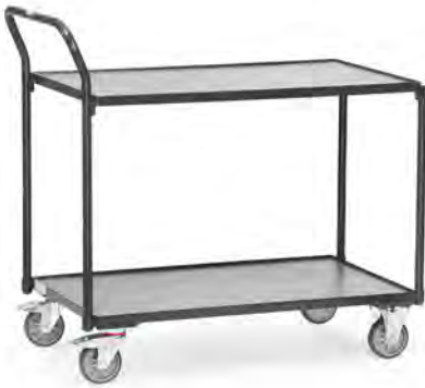
2740/7016 | 2742/7016