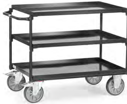
4830/7016 | 4832/7016