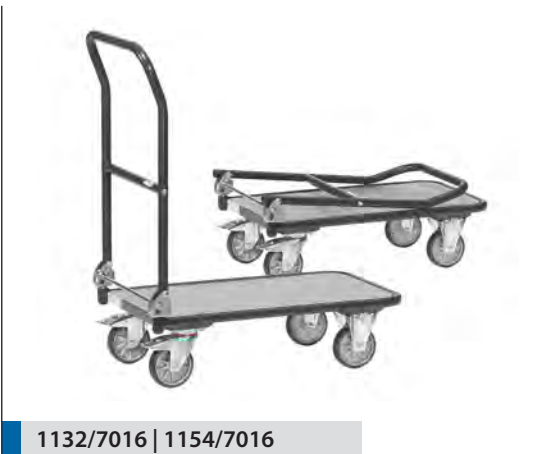
1132/7016 | 1154/7016