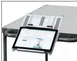
Tablet holder For details see page 185.