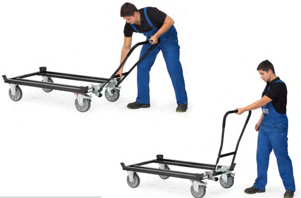
Example of use