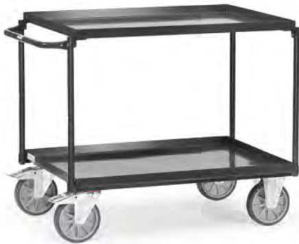
4820/7016 | 4822/7016