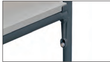
Reinforcement struts increases the capacity of inserted shelves.