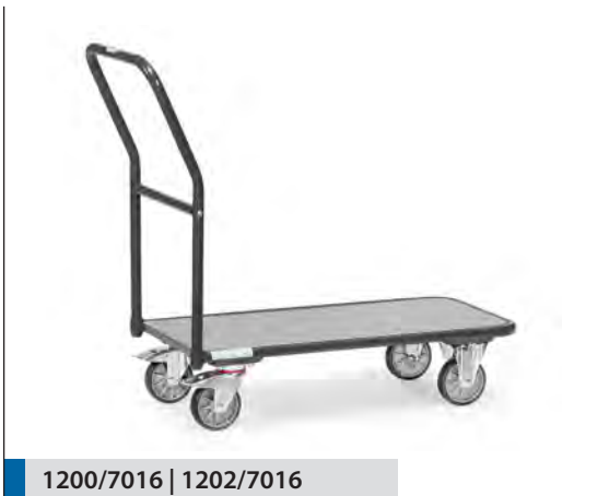
1200/7016 | 1202/7016