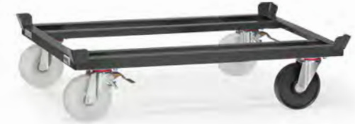
23891/7016 | 23892/7016