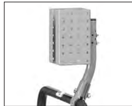
Scanner holder For details see page 185.