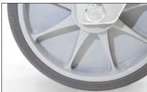
Table top cart 2402/7016

The innovative easy-running TPE-castor in the attractive fetra design is non-marking and odourless. Particularly smooth-running groove ball bearing.