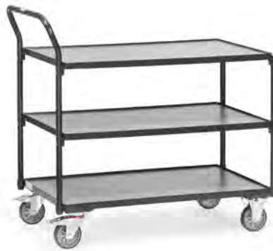
2750/7016 | 2752/7016