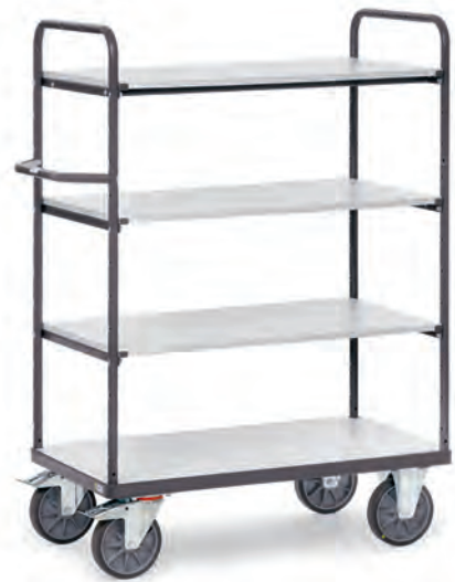
9200 | 9201