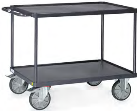
9400W | 9401W | 9402W | 9403W