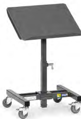
1891* | 1892*