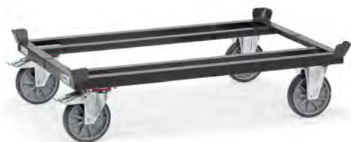
23799 | 23800 | 23801 | 23802