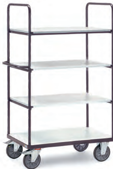
9301 | 9302 | 9303