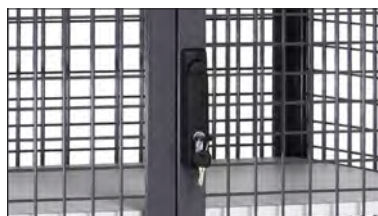
Vertical locking rod with turning lever and cylinder lock.