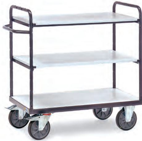
9100 | 9101