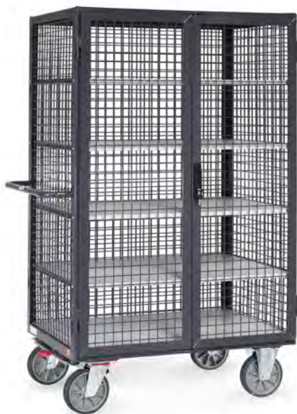
9392 | 9393