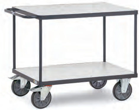
9400 | 9401 | 9402 | 9403