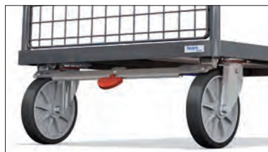
TOTALSTOP - the fetra central brake system With only one foot the rotation of wheels and the swivelling movement of both swivel castors can be securely locked. The brake pedal is always visible to the operator. Standard with TOTALSTOP.