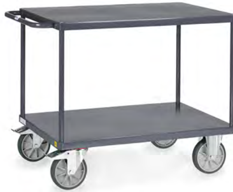
9400B | 9401B | 9402B | 9403B