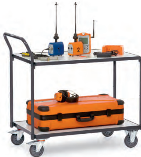
Example of use