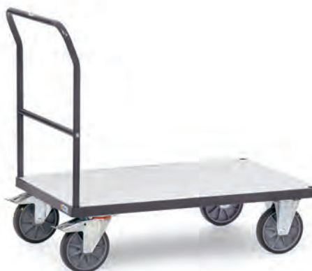
9500 | 9501 | 9502 | 9503