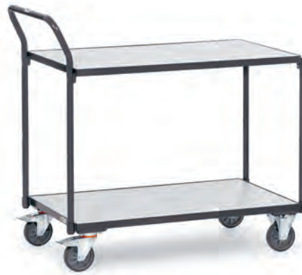
1840 | 1841

Capacity of upper and middle shelves 80 kg.