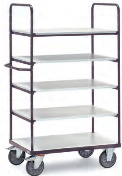
9341 | 9342 | 9343