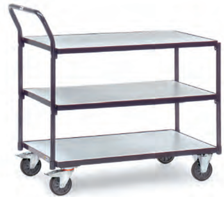
1850 | 1851